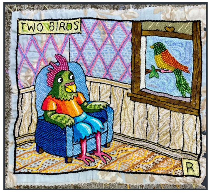
Roz Chast, Two Birds, 2023. Hand embroidery and beads. 10.5 x 12 inches.