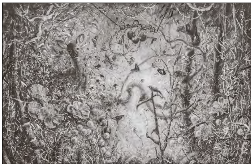
Carol Corey Fine Art