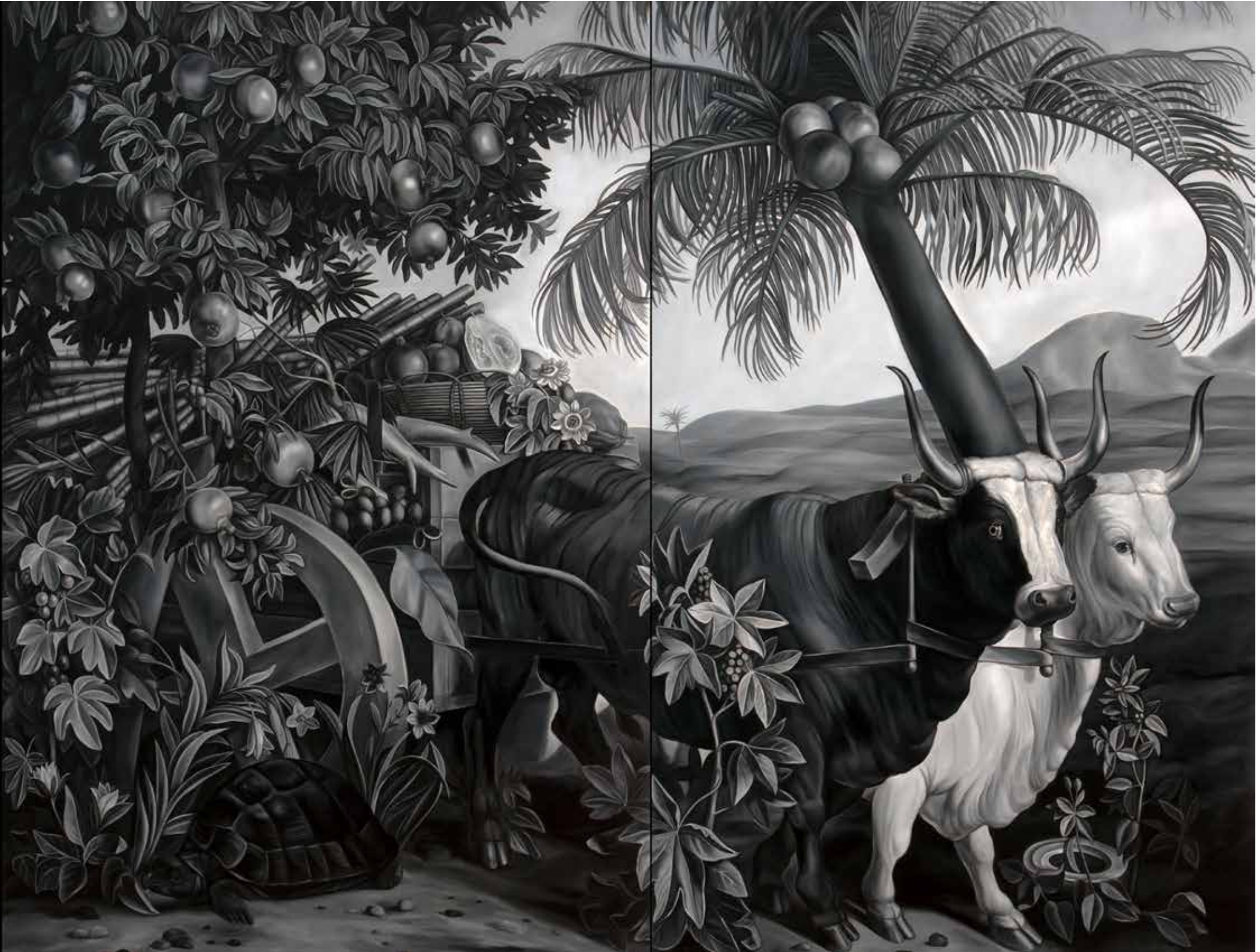
Hitched (after Desportes and Hondecoeter), 2013