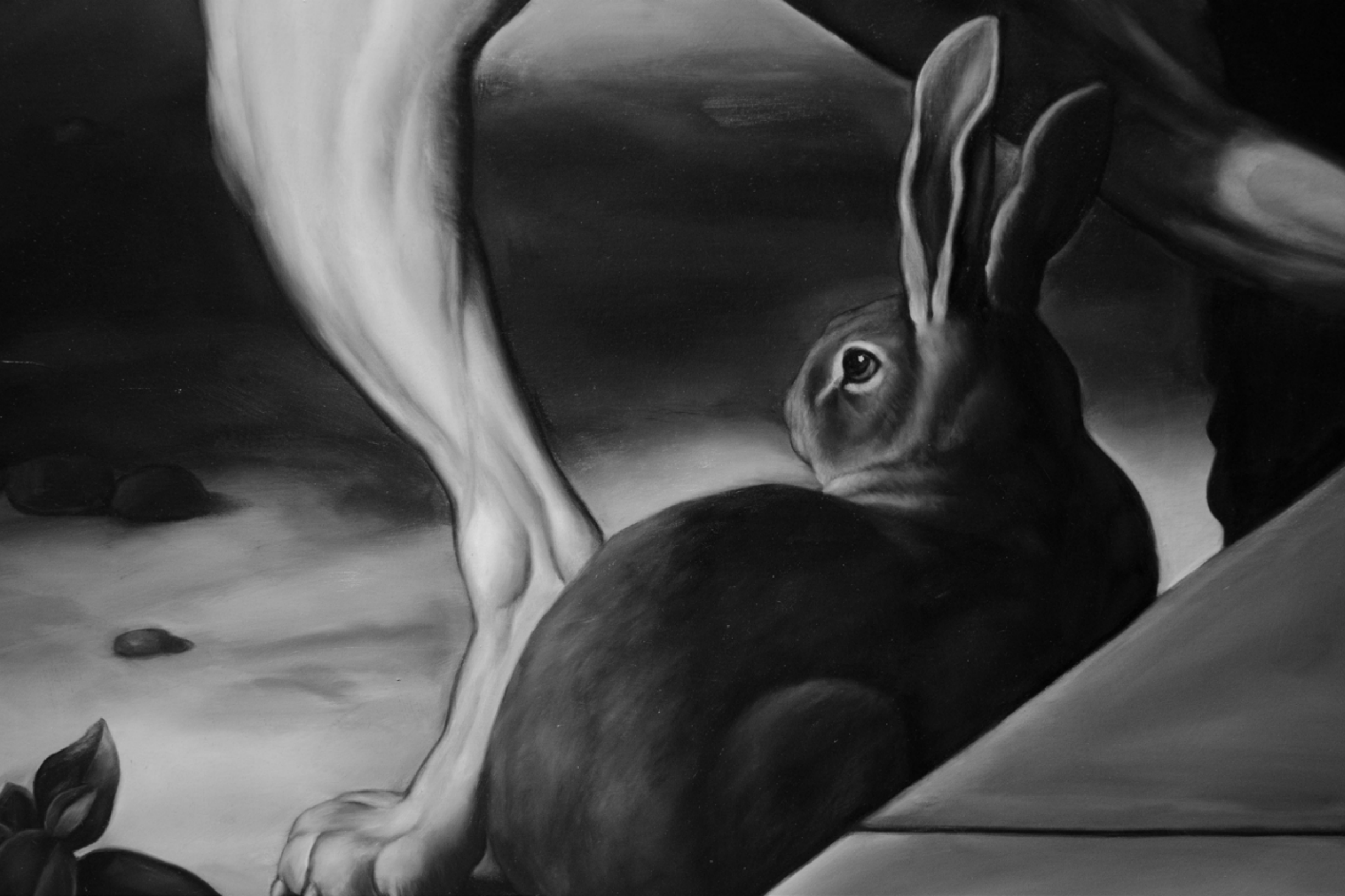
Detail from In Dubious Battle