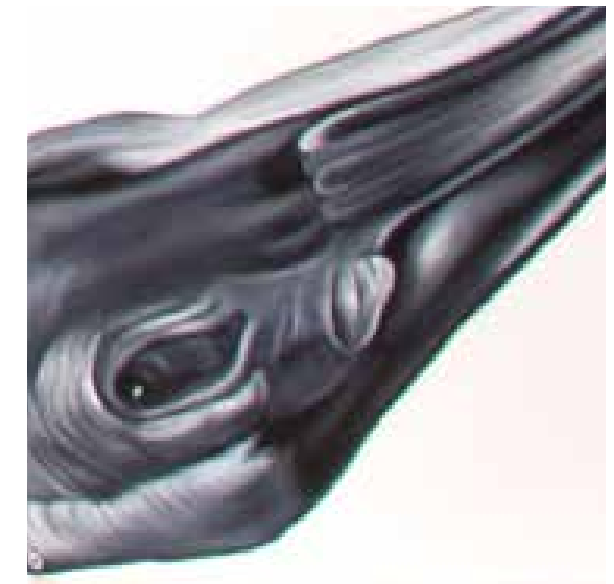
Details from Tiger (after Janssens and Landseer) , White Horse (after Grant and Stubbs) , and Bird (after Oudry)