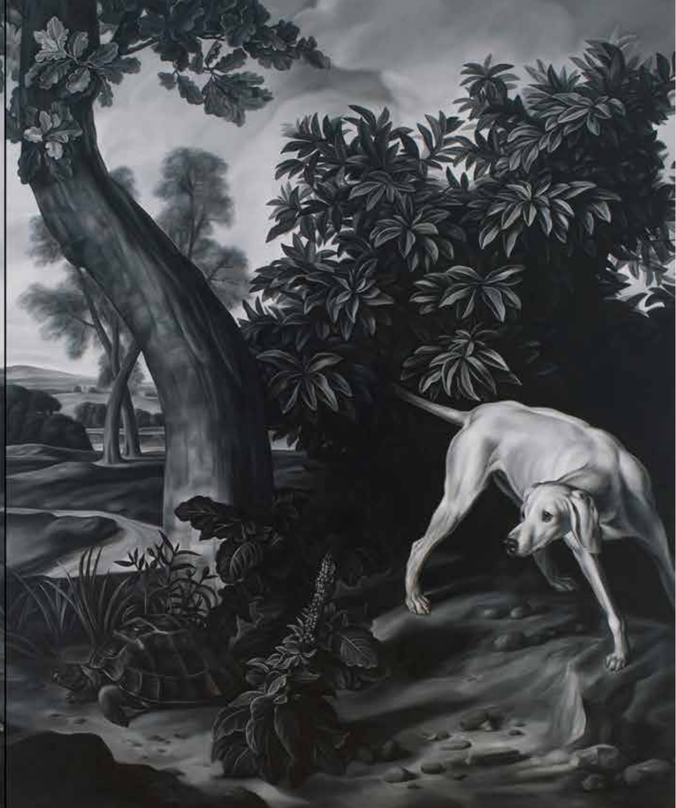
Left: Hound and Cockatoo (after Desportes, Hillegaert, and Weenix) Right: Hound and Tortoise (after Desportes and Hondecoeter), 2014