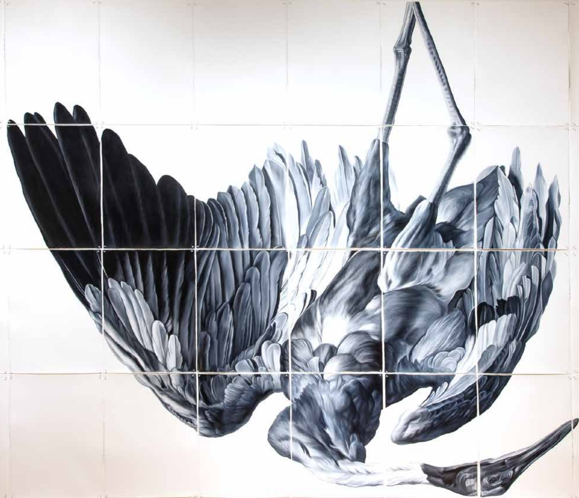
Bird (after Oudry), 2016