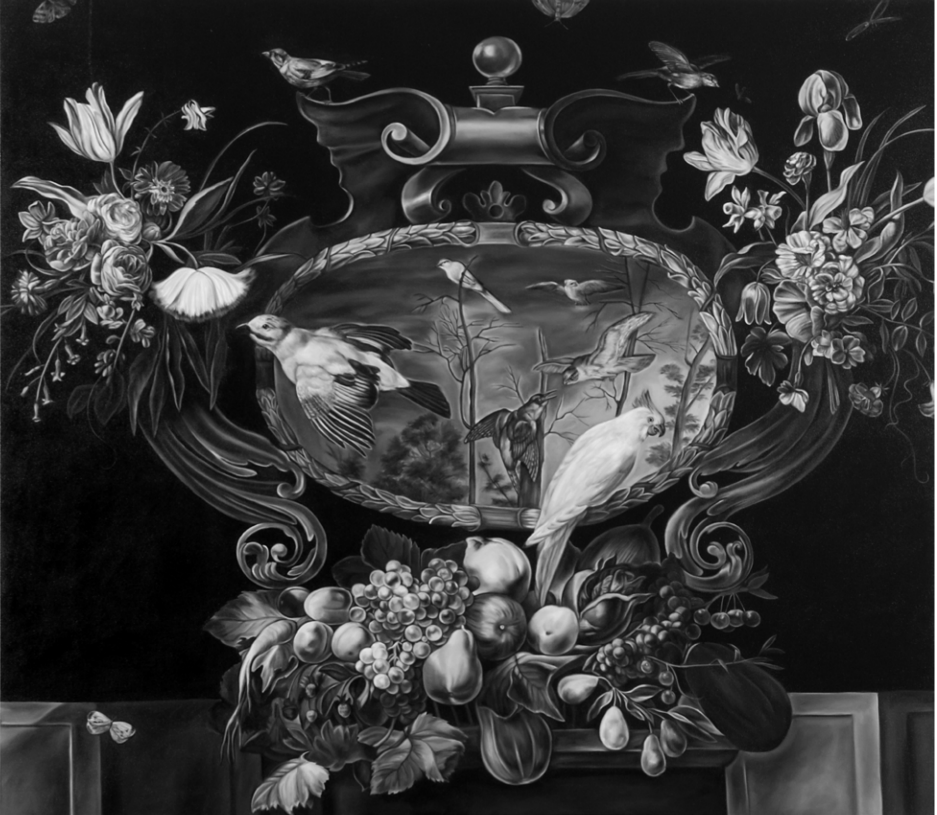
Untitled (after De Laresse), 2007