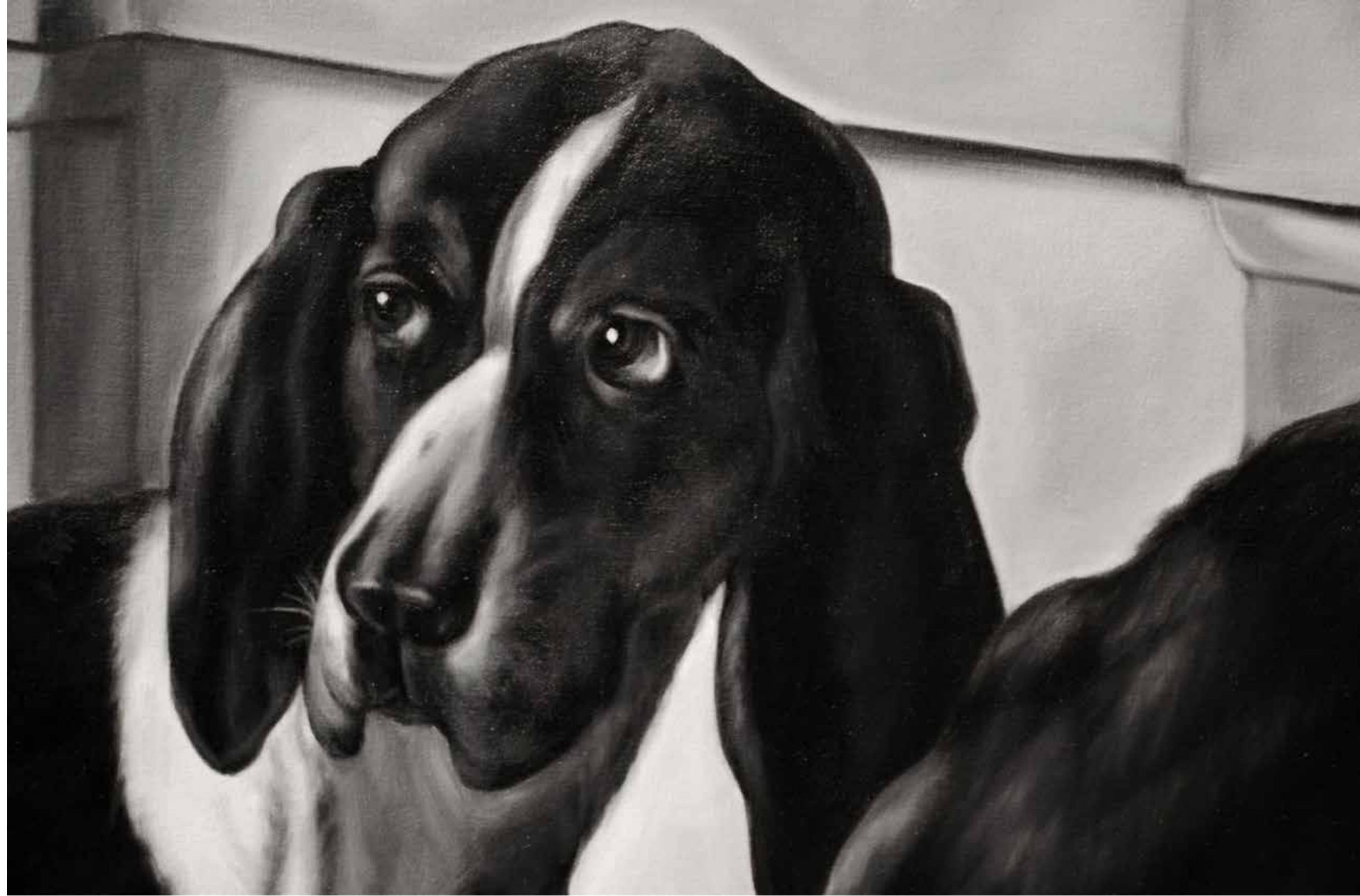
Detail from In Dubious Battle