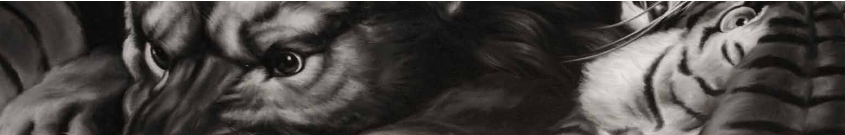
Detail from In Dubious Battle