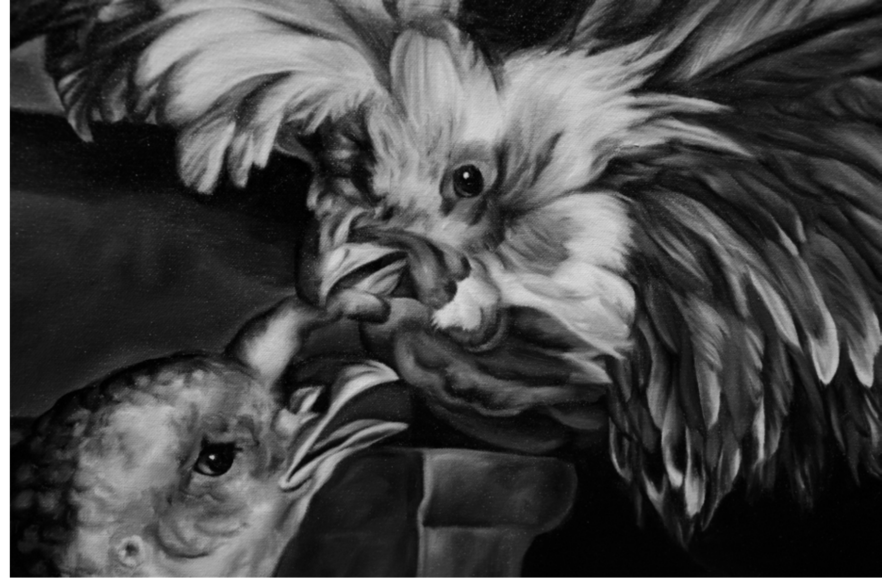
Rooster and Turkey (after Hondecoeter), 2009