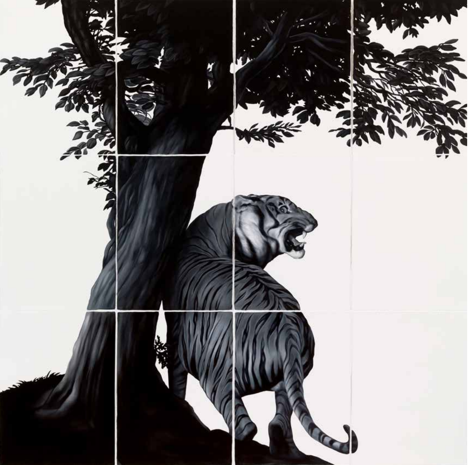
Tiger (after Janssens and Landseer), 2017