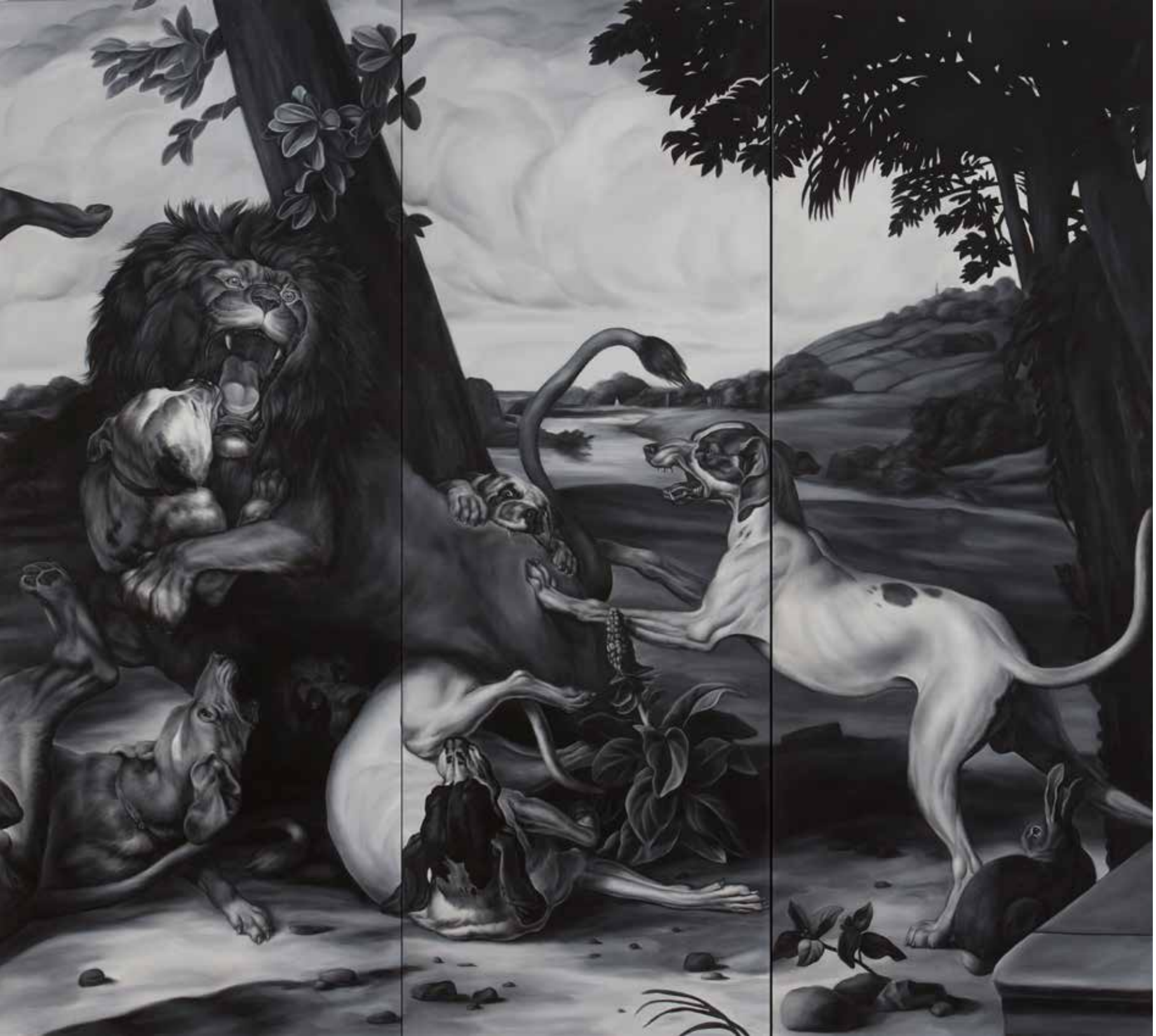
In Dubious Battle, 2013