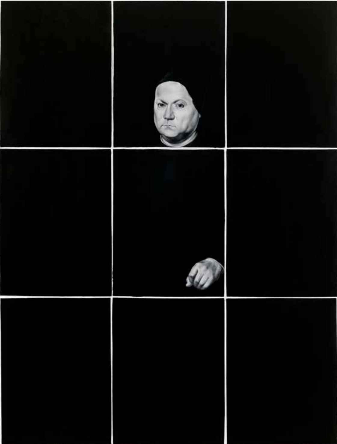
Men (after Perugino, Raphael and Van Dyck), 2017