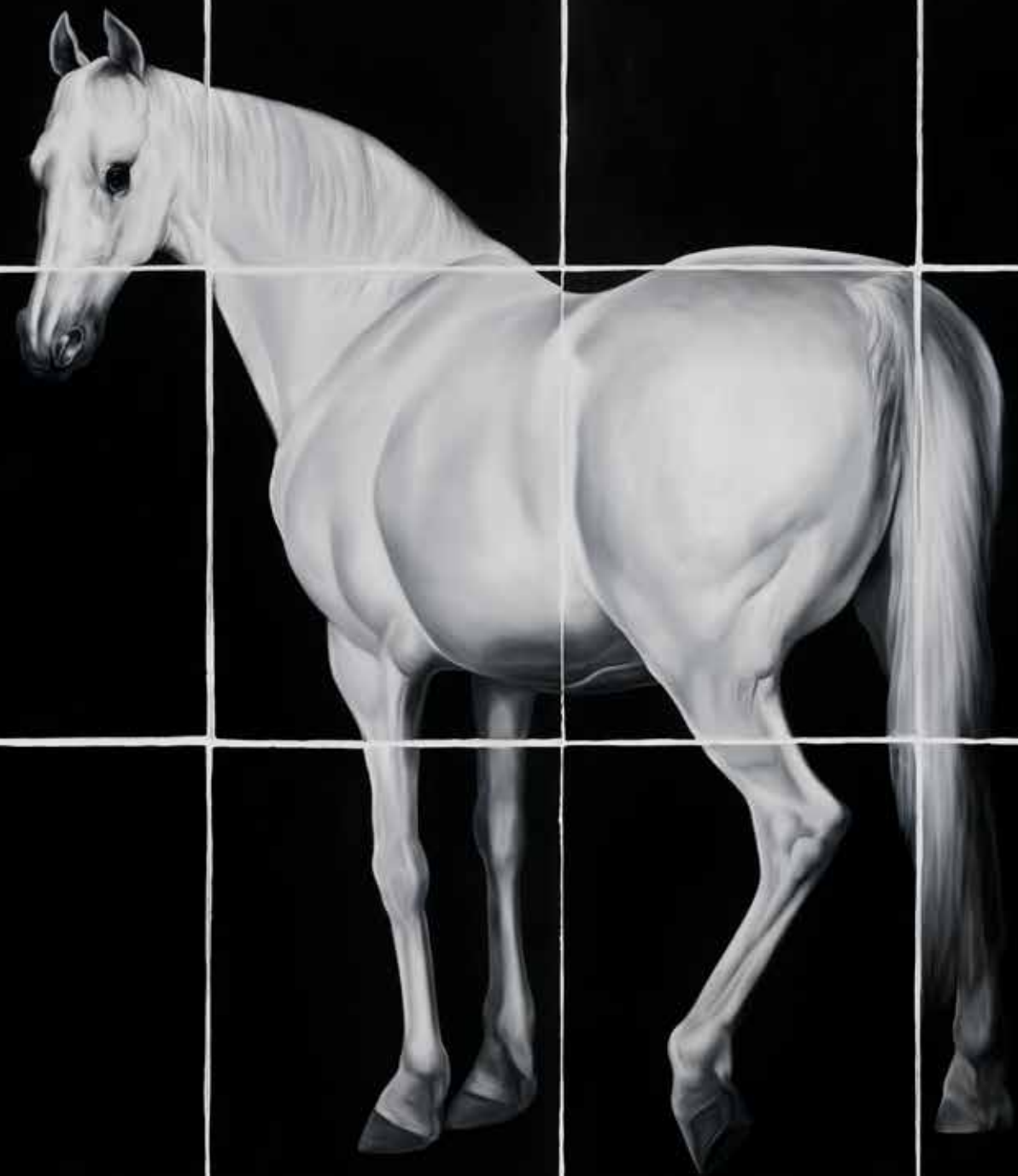
White Horse (after Grant and Stubbs), 2016