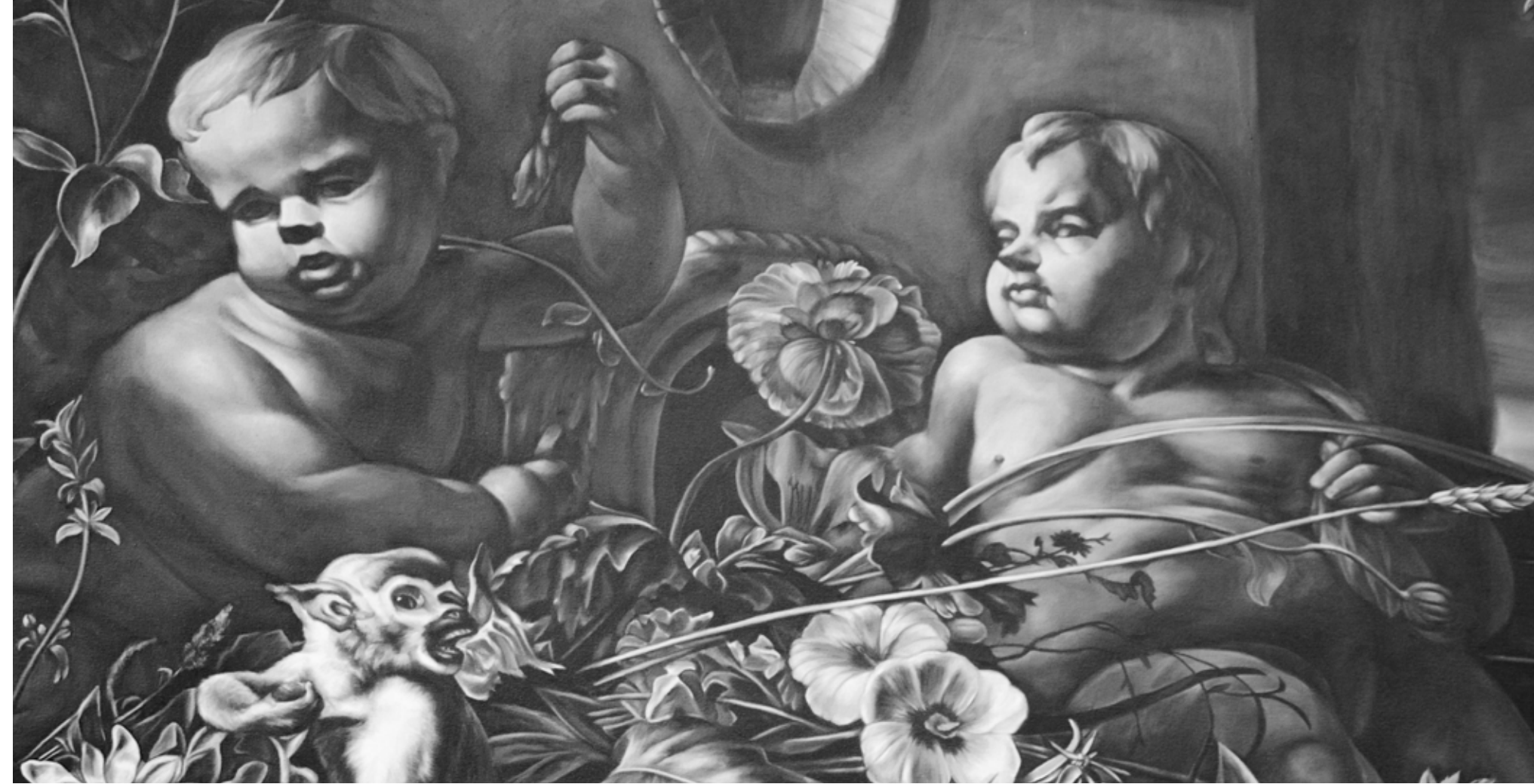
By the Well (after Weenix and Hondecoeter), 2010