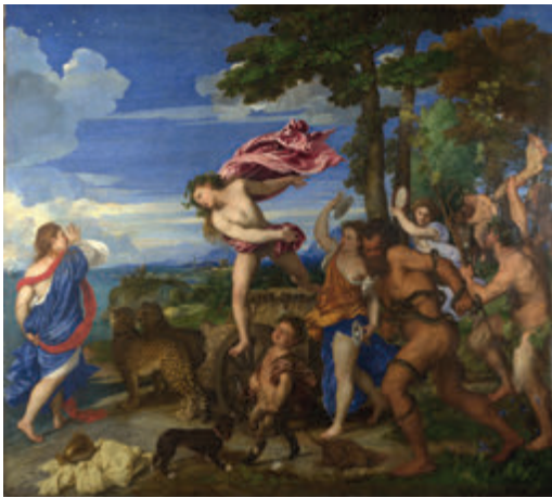
Titian Bacchus and Ariadne , 1522-23 Oil on canvas (applied onto conservation board, 1968) 69.5 x 75 inches