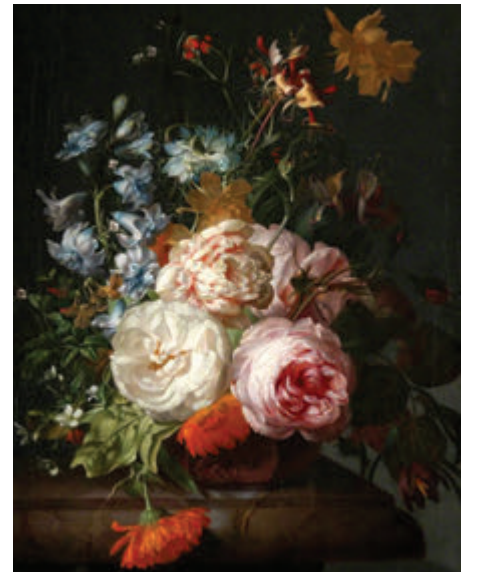
Rachel Ruysch Flowers in a Terracotta Vase , 1723 Oil on canvas 15.5 x 12.4 inches