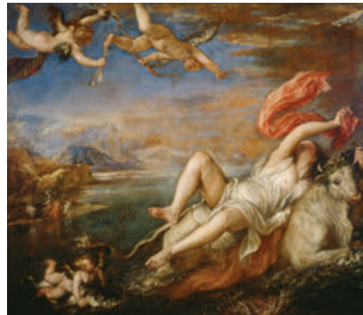
Titian The Rape of Europa , 1560-62 Oil on canvas 70 x 81 inches