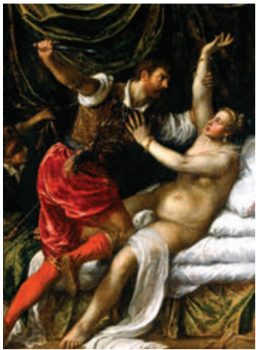
Titian Tarquin and Lucretia , 1571 74.4 x 57.1 inches Oil on canvas