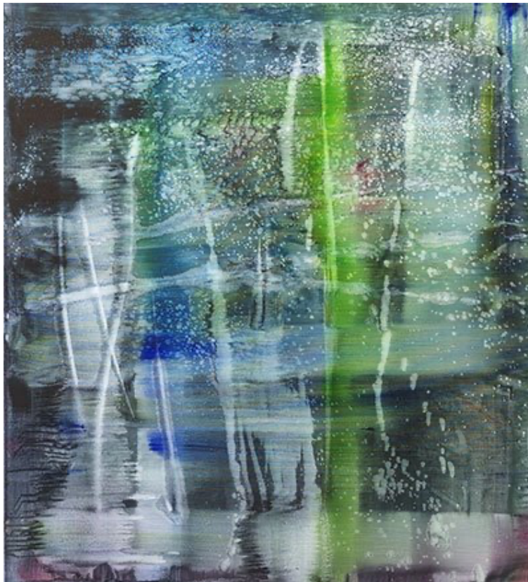
Matthias Meyer, Clearwater , 2019. Oil on linen, 43 1/4" x 39 1/4"

In the exhibit Silent Water , Meyer's paintings filled the spacious Danese Corey Gallery in Chelsea with dream-like depictions of the natural world, like windows onto blurred wetlands, pools, and marine vegetation, where the real meets abstraction. The repetition of watery blue, purple, and green oils on linen bleeding and spilling like watercolors and creating vertical ribbons of color gave this viewer a feeling of being just under the water's surface; at other times of hovering over the water or standing before curtains of water and sea grasses.