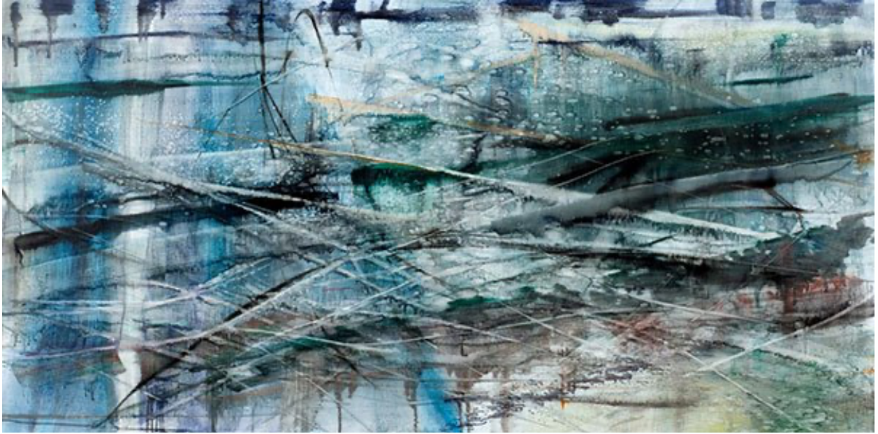
Matthias Meyer, Insomnia , 2014. Oil on linen, 59" x 118"

The painting "Insomnia," with its horizontal landscape format, is a moody representation of what could be an icy blue-green pond beneath watery drops and slashes of inky black-and-white scratches on ice. Does the title reference the artist working sleeplessly through the night or is it a visualization of what insomnia might look like if it had a physical form? Whatever Meyer's reason for his title, the mystery is for the viewer to contemplate.