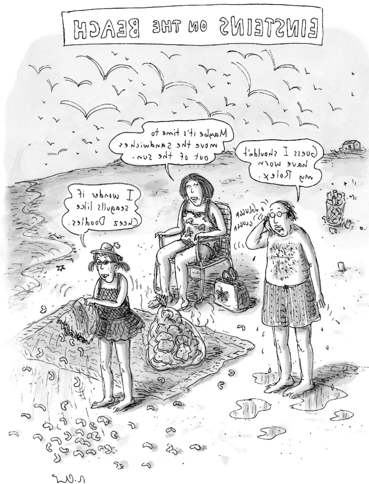
From the July 12, 2004 issue.

Over the years, Roz Chast has demonstrated a remarkable talent for imagining the vast taxonomy of things that can—and sometimes do—intrude on a day of fun at the beach. They include but are not limited to: depressed poets, “ultra-hairy” men, greedy seagulls, sunburns, and, as on this week’s cover, a different kind of text message from mom. We recently spoke to the artist about becoming a grandmother and why she prefers oceans that are a little too cold.